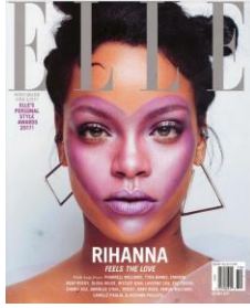
October 2017 Issue